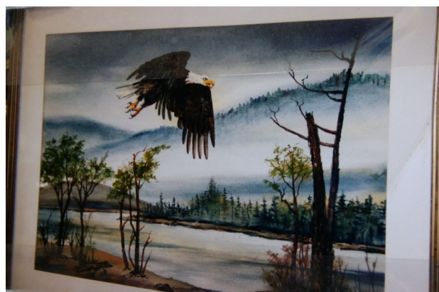
Samples Sister's work.