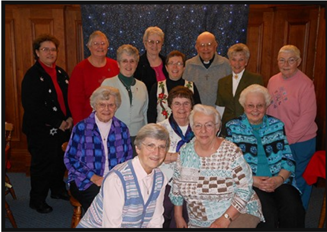
Staff full time and volunteers