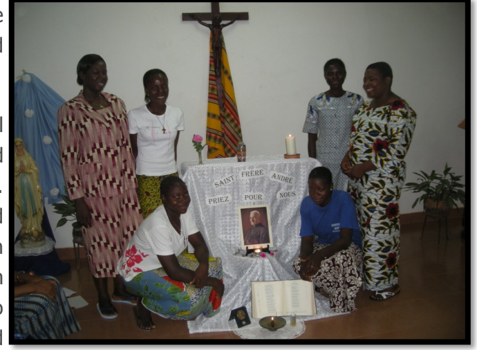
Sisters of Holy Cross from West Africa.

The first two West African women to make final vows in Africa had begun the newly-established postulancy program in Sikasso, Mali in 2007. More than twenty-eight others have followed them over the years. In Mali today, they are in charge of a residence for girls who come from different villages to the city of Sikasso to go to high school. In Burkina Faso, they are involved in a junior-senior high school where a bishop