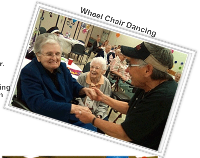
Wheel Chair Dancing