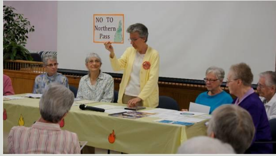
Justice and Environment Mission Group

enthusiasm in the room. Indeed, Holy Cross is alive and well!